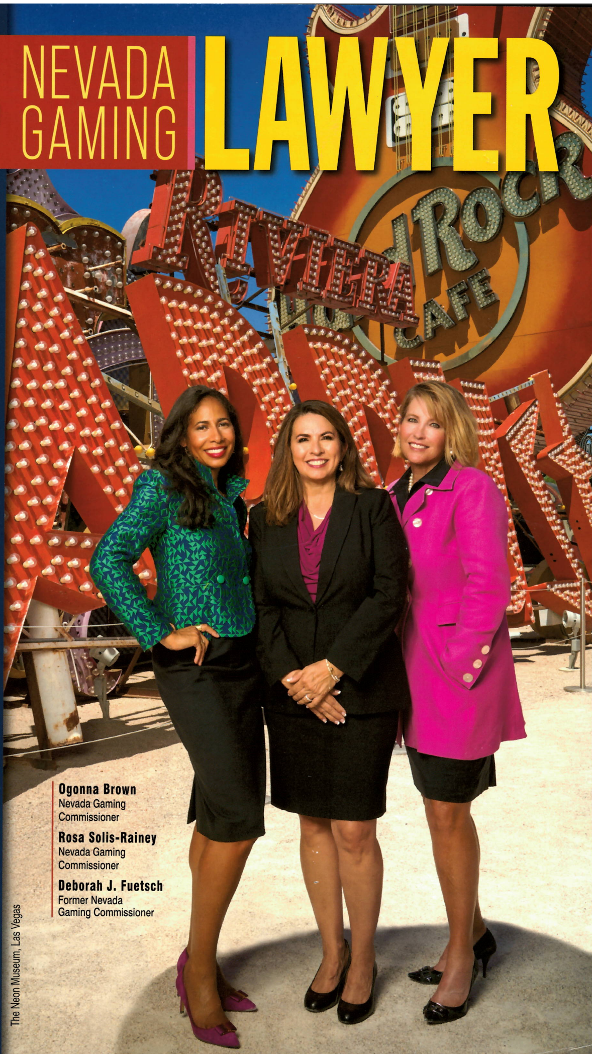
The Neon Museum, Las Vegas

Message from the UNLV Gaming Law Journal